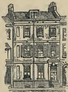
No. 5, Great Cheyne Row, Chelsea, THE RESIDENCE OF MR. CARLYLE SINCE 1834.

FIFTH EDITION. WITH A NEW LIFE OF THE AUTHOR.